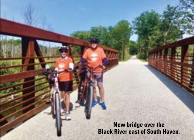
New bridge over the Black River east of South Haven.